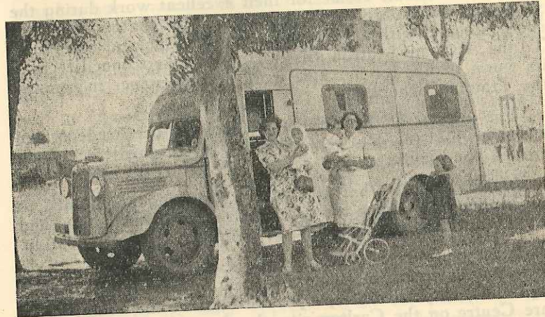
"Present Caravan at Lalbert."

This service has now been on the road five and a half years. A successful year's work is reported despite the long interruption during the year through the sudden and tragic