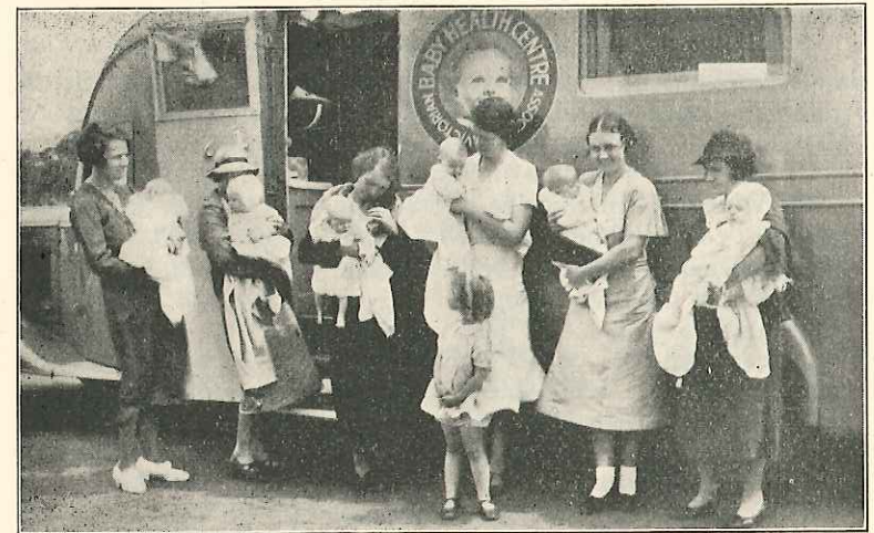
Mallee Mothers attending Travelling Baby Health Centre.

There was some trouble with the generator and distributor, and the clutch linings have been renewed from time to time, this being due to the caravan having to travel through so much heavy sand. During the very hot spells several tyre blow-outs occurred.