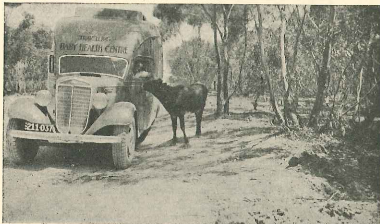
"An unusual young visitor seeks aid from the Sisters."

Roads have on the whole improved, but some are very rough and dusty owing to continued dry weather.