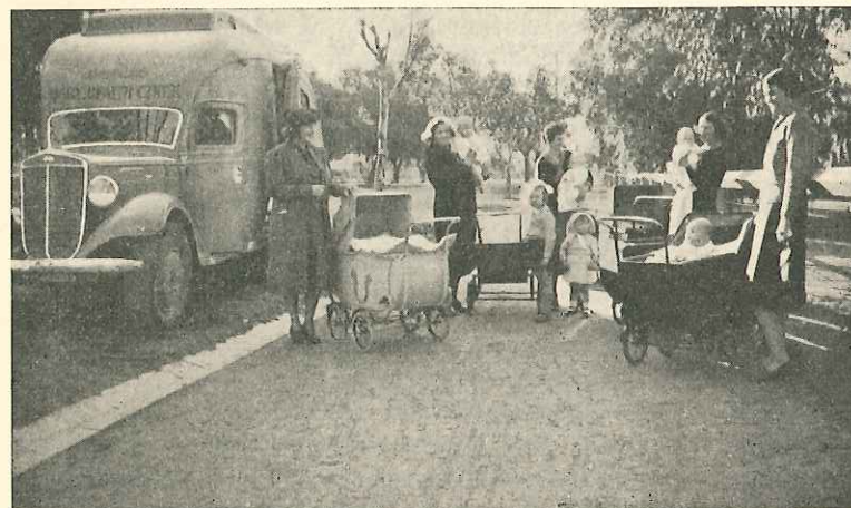
"Mallee Mothers value their Travelling Centre."