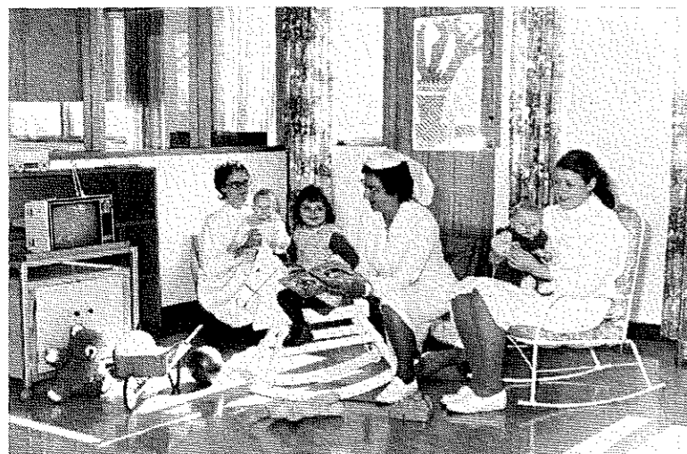
Children's play room in Dr. Doris Officer Wing.

The same applies to members of voluntary Committees of Management, and Auxiliary workers attached to hospitals, and we all know that there is a deep, indefinable sense of reward in so doing.