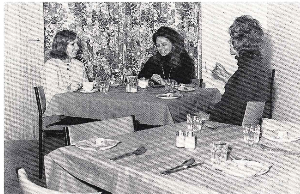
Mothers' dining room—Elvie Curtis Wing.