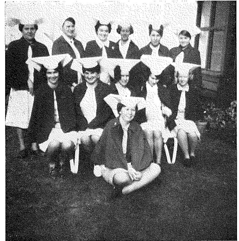
Infant Welfare Trainees at Queen Elizabeth Hospital.

Many more mothers would be enabled to breast-feed their babies if on return from hospital they could have the services of an efficient home-help to assist them in their homes, so that the mother can get adequate rest which is so essential at this time, especially if there are other young children to look after as well as the baby.