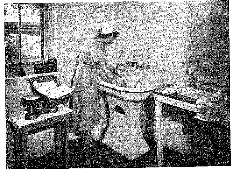
Mothercraft Student Nurse bathing a baby.