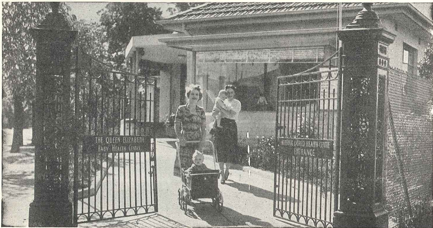
Entrance to Baby Health Centre at Queen Elizabeth Hospital