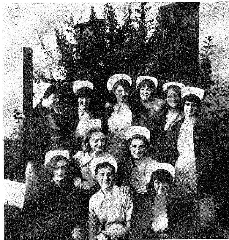
Trainee Mothercraft Nurses at Queen Elizabeth Hospital.

Training Functions. —Training of Baby Health Centre Sisters and Mothercraft Nurses is an important work of the Queen Elizabeth Hospital for Mothers and Babies. These highly-trained Nurses take skilled advice to countless mothers all over the State.