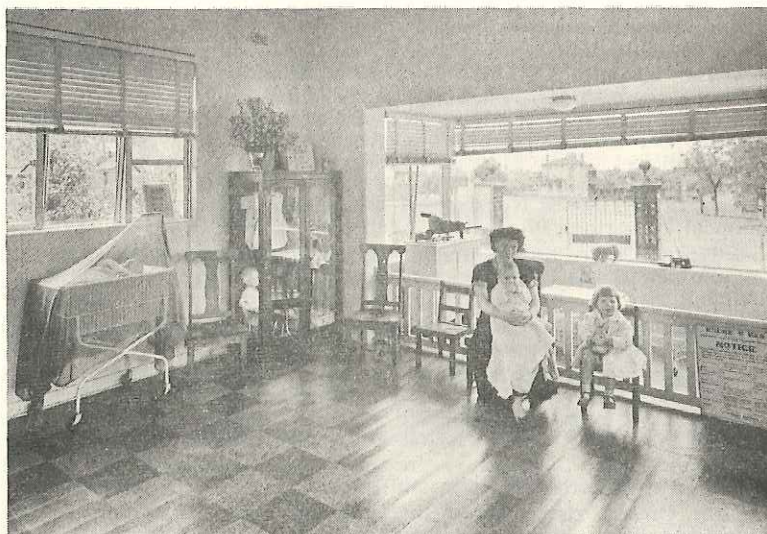
Waiting Room at the Queen Elizabeth Centre.