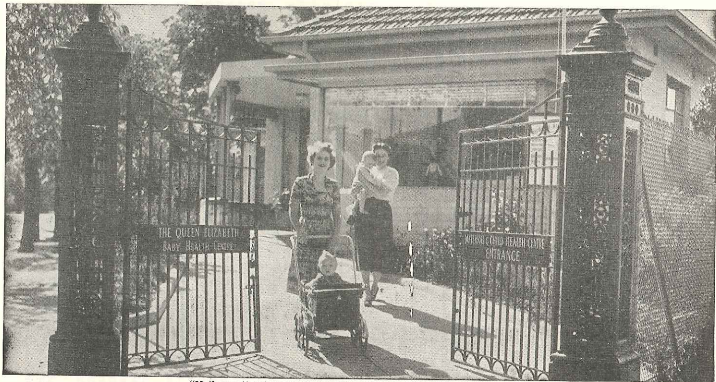
"Mothers attending the Queen Elizabeth Baby Health Centre, Carlton."