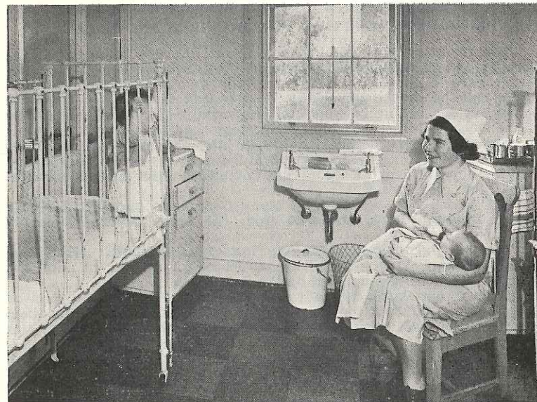
"In the Nurseries"—Difficult and non-thriving babies receive special care at the hospital.