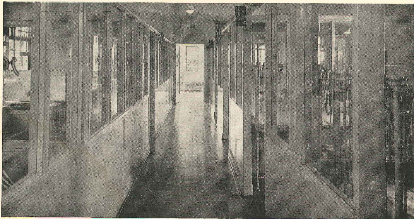
Queen Elizabeth Hospital for Mothers and Babies, Babies' Nursery.