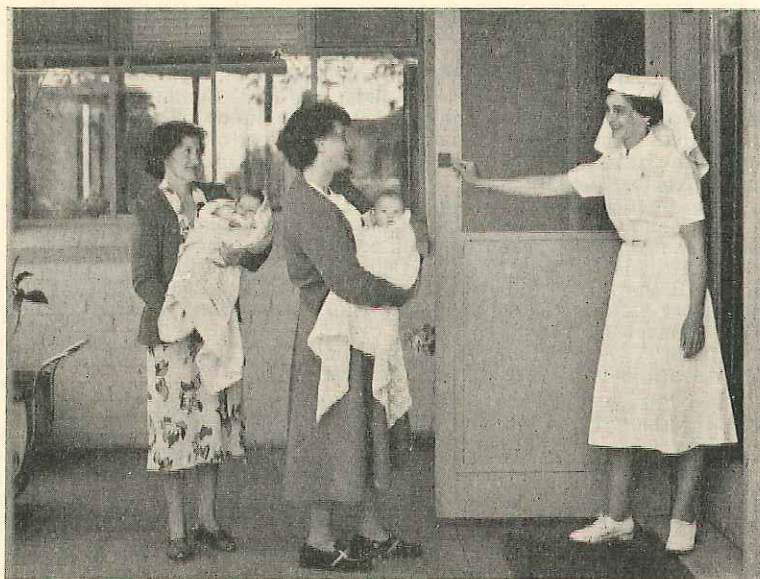
Mothers arriving at the Queen Elizabeth Hospital Baby Health Centre.

Of all services provided for the mothers it is one that comes most intimately in contact with them, both through the mothers' regular attendances at the Centres and by the extensive system of home visiting, which is part of the Sisters' work.