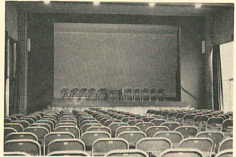
Isabel Younger Ross Memorial Hall. View of Main Hall and Stage.