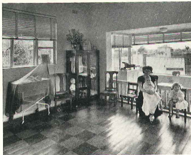
Waiting Room at the Queen Elizabeth Centre.