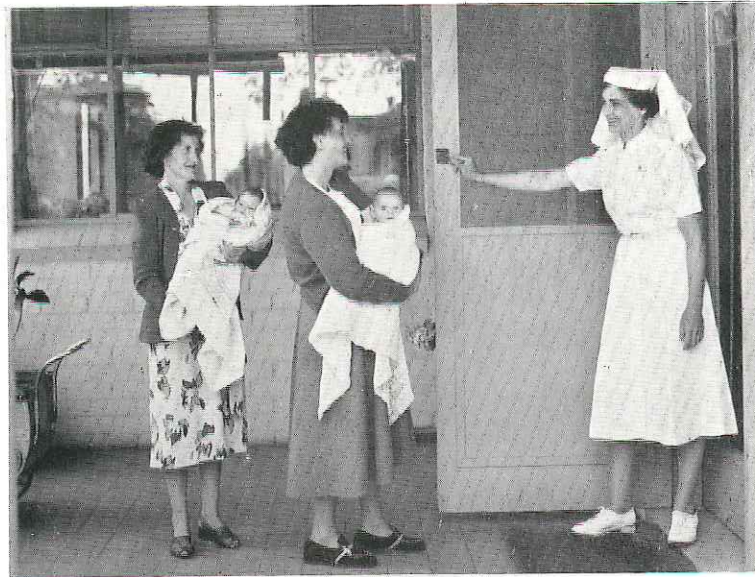
Mothers arriving at the Queen Elizabeth Hospital Baby Health Centre.