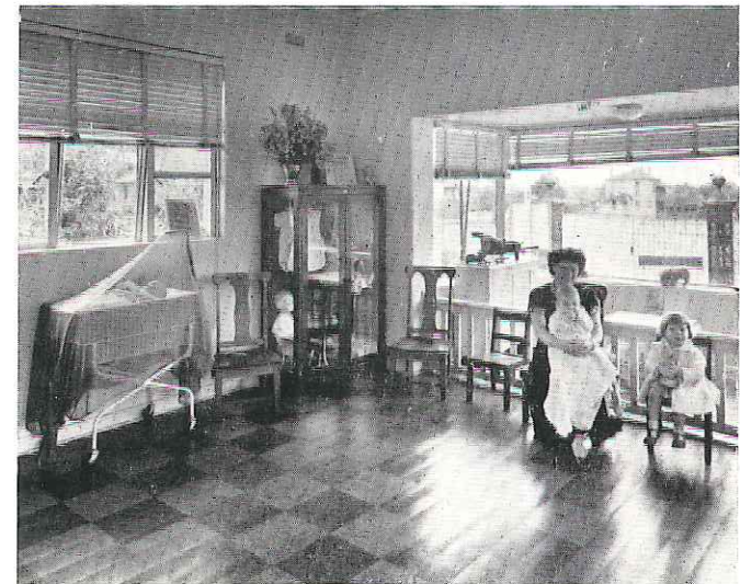
Waiting Room at the Queen Elizabeth Centre.