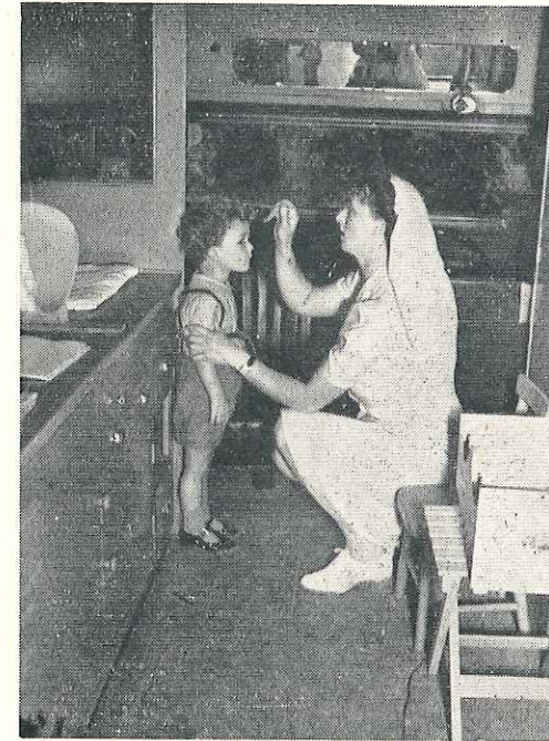
V.B.H.C.A. Travelling Baby Health Centre.