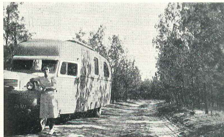
V.B.H.C.A. Travelling Baby Health Centre.