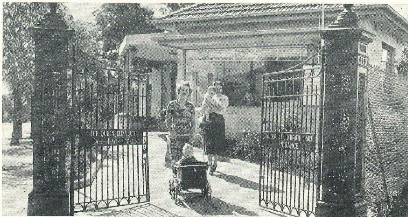
Queen Elizabeth Maternal and Child Health Centre. Baby Health Centre Entrance.