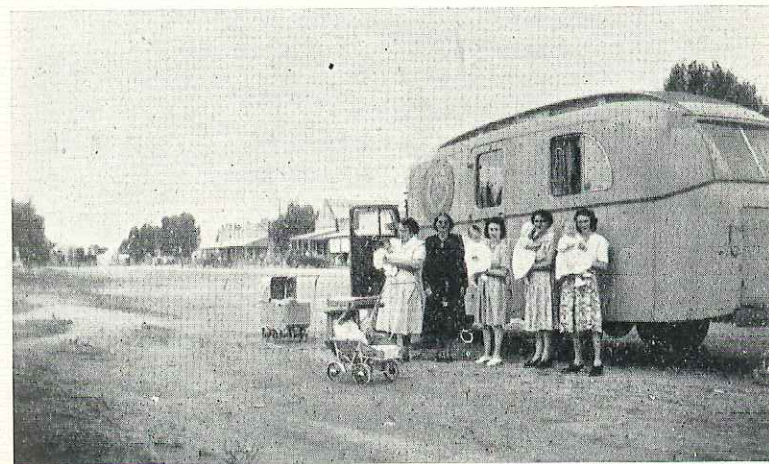
V.B.H.C.A. Travelling Baby Health Centre.

The Council thanks the Voluntary Helpers of the many Baby Health Centres for the regular time they give each week to help the Sisters-in-Charge of Centres. This help is very greatly appreciated; it would be extremely difficult for the Sisters-in-Charge of busy Centres to give adequate time in advising mothers without this assistance of weighing the babes and carrying out other helpful Centre duties.