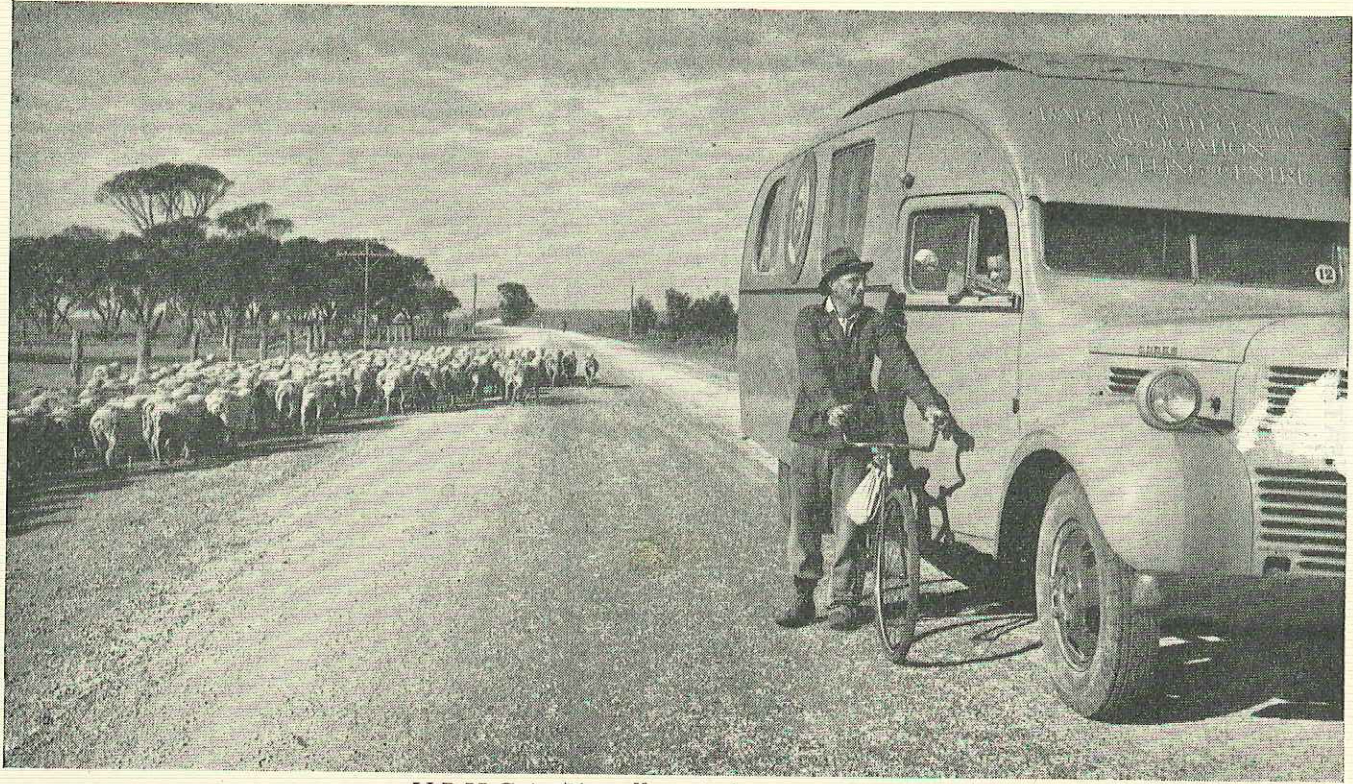
V.B.H.C.A. Travelling Baby Health Centre