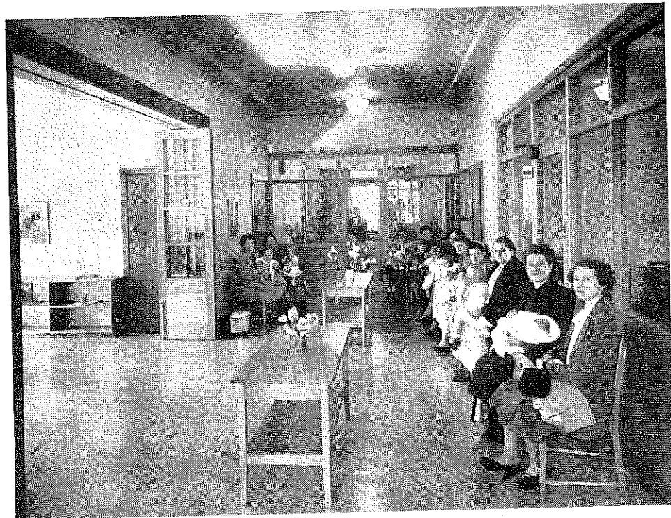
WAITING ROOM AT ALBERT PARK BABY HEALTH CENTRE