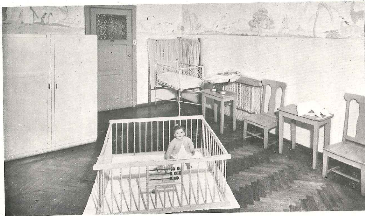
DAY NURSERY AT MOTHERCRAFT HOME