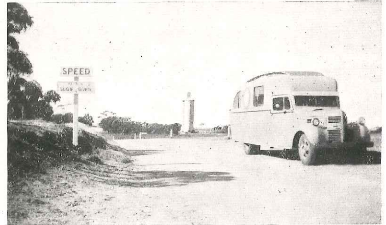
CARAVAN AT SPEED

The Caravan was bogged in mud on one or two occasions early in the winter after heavy rains, but the farmers are always very helpful and do not hesitate to use their tractors to get the Caravan going.