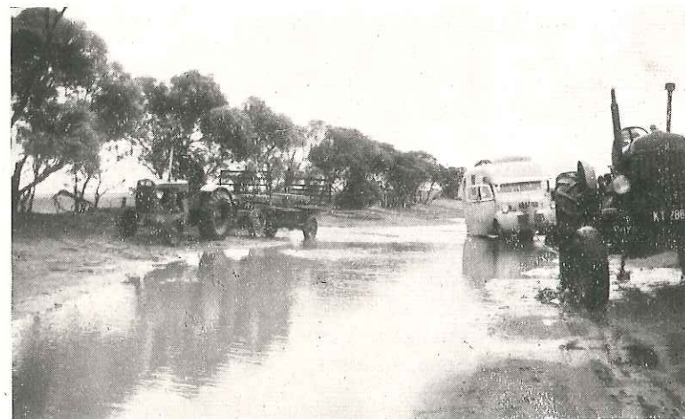
CARAVAN BOGGED AT NYARRIN

Annuelo, Robinvale, Chinkapook, Chillingollah, Nyah, Manangatang, Balranald, Goodnight, Piangil, Wood Wood, Nyah West.