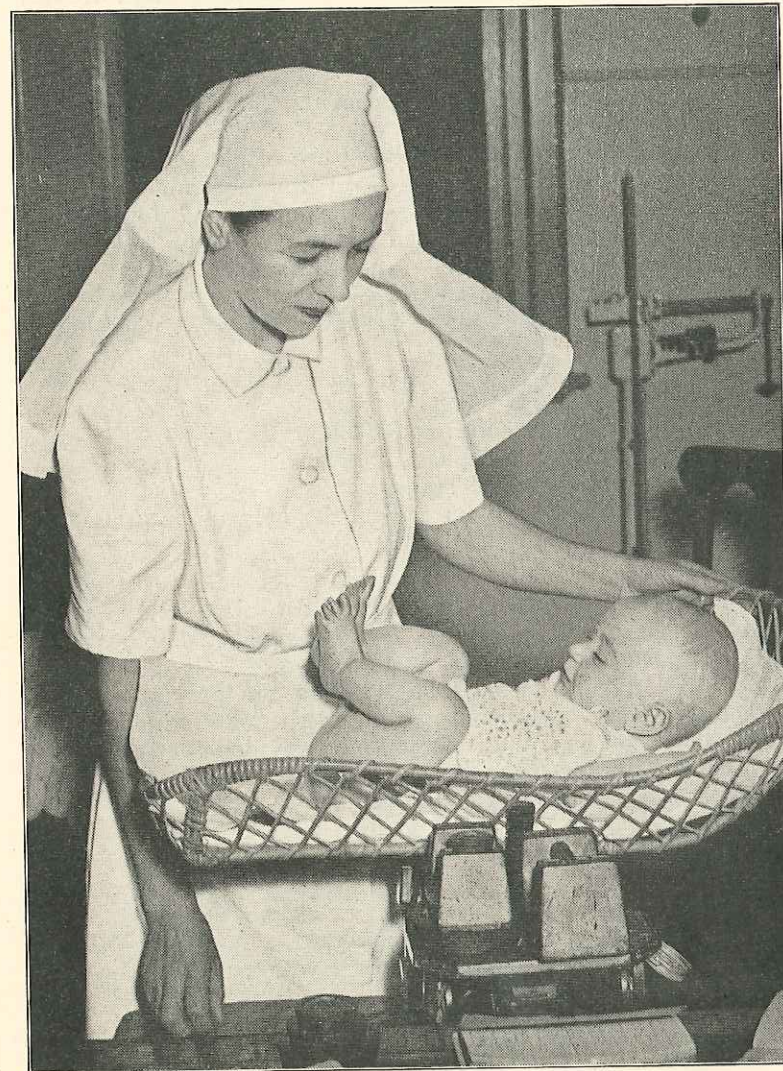
Weighing Baby at Mothercraft Home.

Matron reports that 93 babies requiring admission to the Mothercraft Home for special care and investigation had to be refused this year on account of lack of bed accommodation. Last year 52 cases had to be refused and 70 the year before. Extended accommodation is one of the most pressing