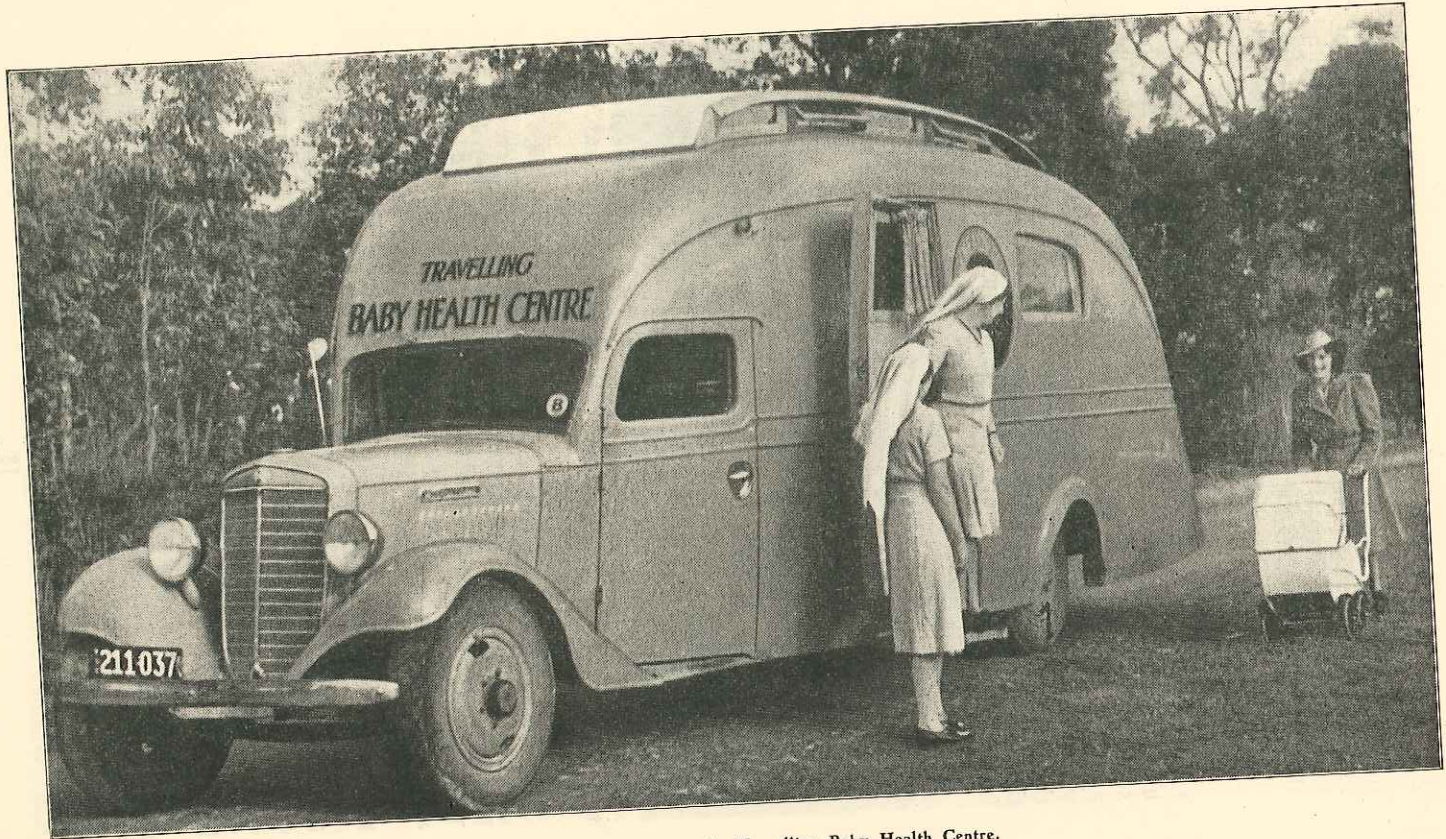
Welcoming a Mother to the Travelling Baby Health Centre.